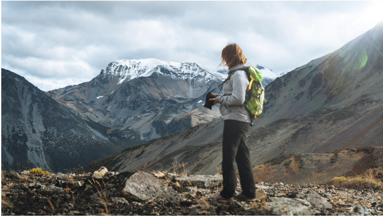
Perkins Peak | Jesaja Class