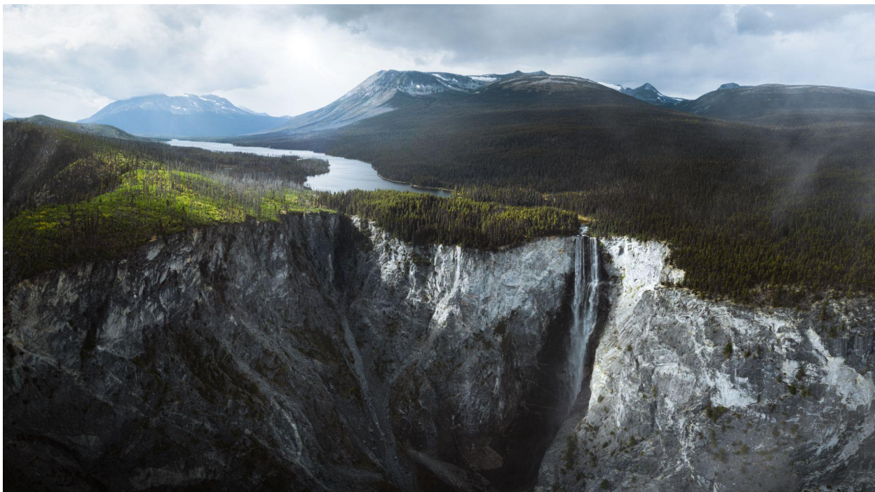
Hunlen Falls | Jesaja Class