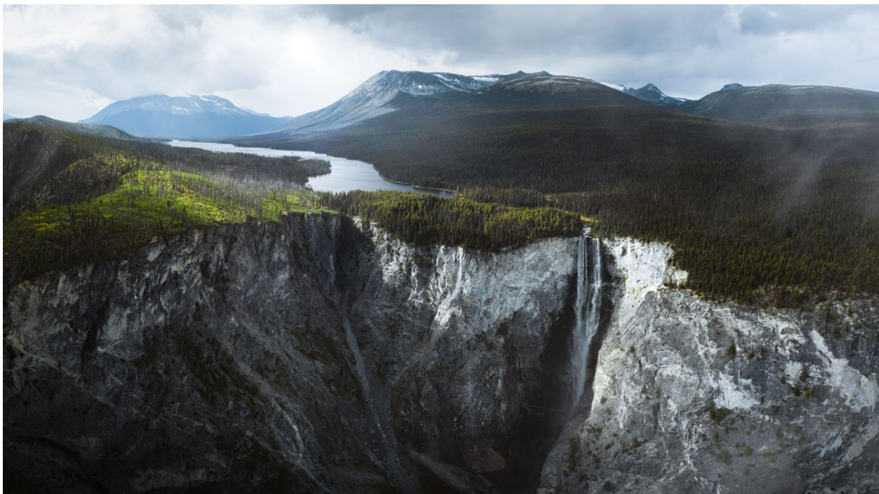
Hunlen Falls | Jesaja Class