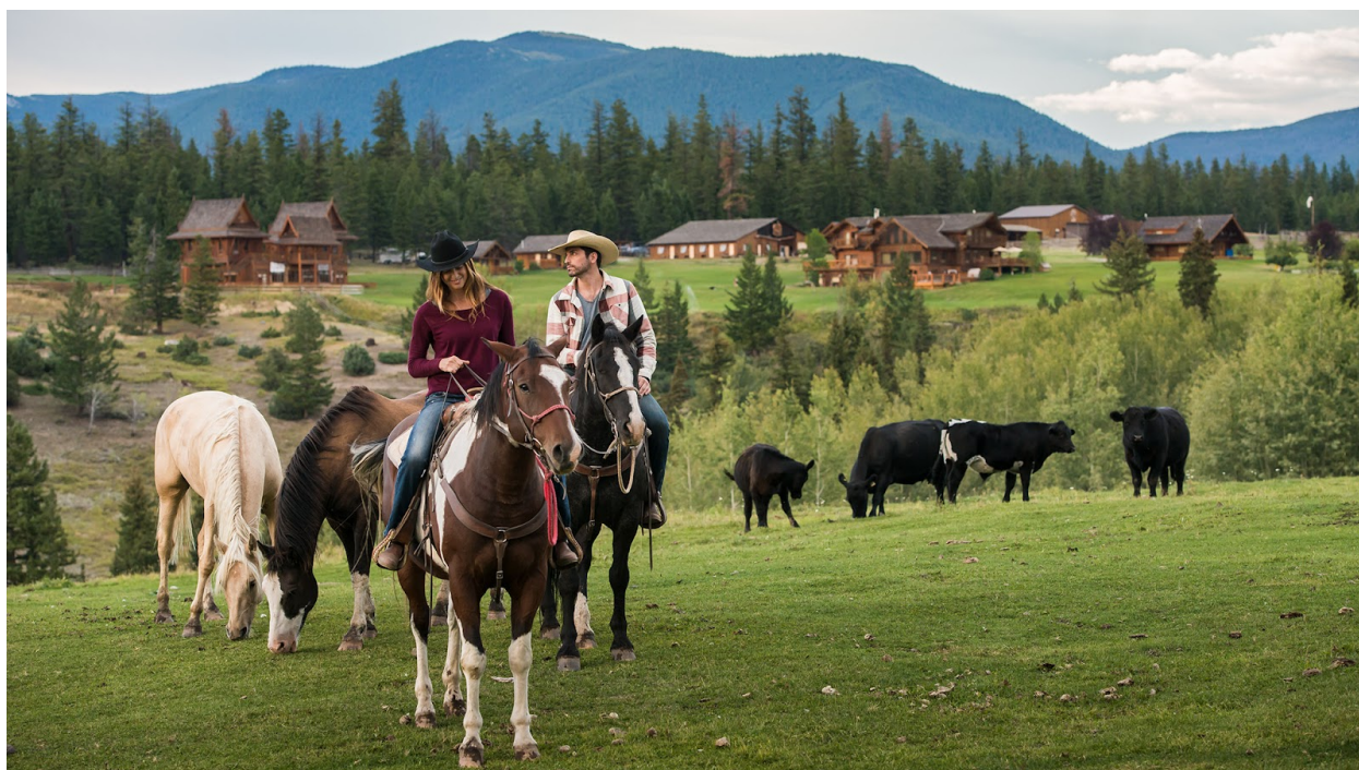
Echo Valley Ranch & Spa

Is this the year of your epic vacation? What could be better than a trip to the wide-open spaces of the Cariboo Chilcotin Coast - where unique experiences, adrenaline-filled adventures, and natural wonders are in full supply! To help you curate your next incredible getaway from the everyday, we've put together a list of some of the most bucket-list-worthy excursions and experiences throughout the region: