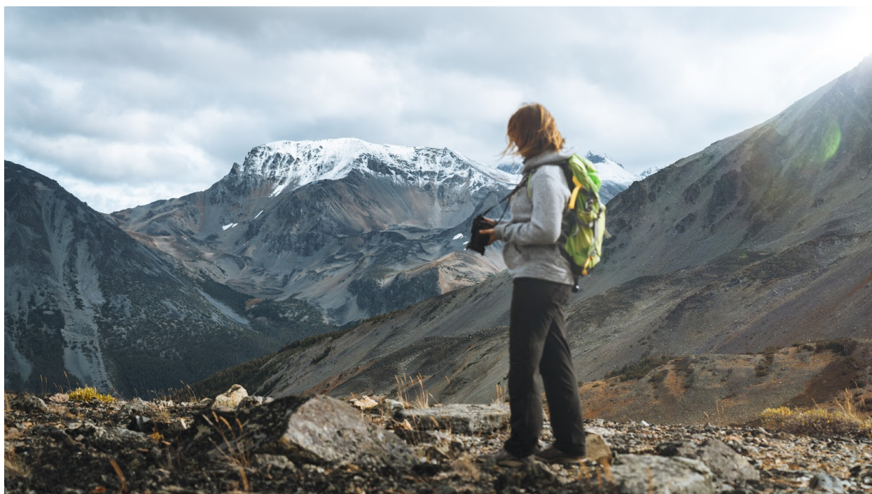
Perkins Peak | Jesaja Class